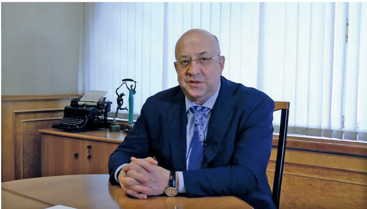
Vladimir Pligin, Co-Chairman of the Association of Lawyers of Russia, delivered a welcoming speech.